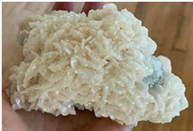
Dolomite with fluorite, China

Dolomite can be a great ally in helping move through grief.