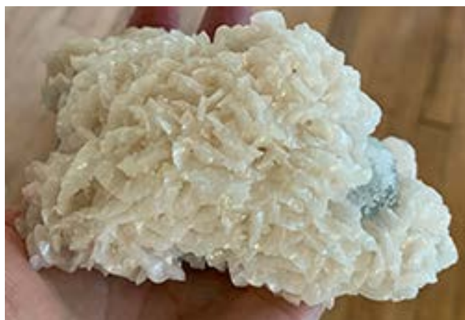
Dolomite with fluorite, China

This gentle and nonjudgmental support is invaluable as we move through the cycles of wild grief. Eventually the catharsis will cleanse us and we will be able to perceive our blessings and understand the lessons our life experience has to offer.