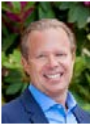
Dr Joe Dispenza